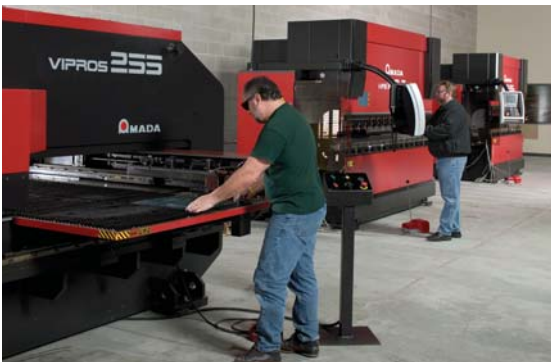
FabriFast is equipped to work with a variety of materials including carbon, galvanized and stainless steel, as well as aluminum.

If, like us, you value speed and responsiveness, detest waste and needless overhead, and believe in the capability of the American worker, FabriFast should be on your short list of firms to consider for your next sheet metal fabrication job.