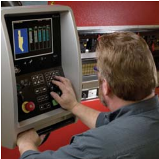
CNC machines and advanced metal forming software help ensure quality and consistency from run to run.

Many foresee a bleak future for U.S.-based sheet metal fabrication. We disagree. It is true that high-volume, low-mix metal fabrication is increasingly moving to lower-cost countries. But the need for customized, quick-response, cost-effective sheet metal fabrication is vibrant and growing.