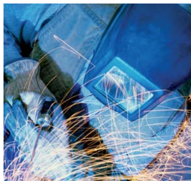
FabriFast provides spot, MIG and TIG welding capability.