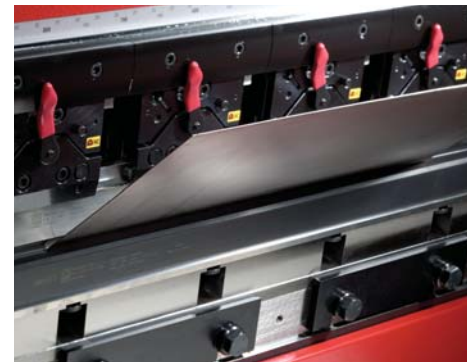
We exclusively use "air bend" forming techniques to increase speed and reduce customer tool costs.